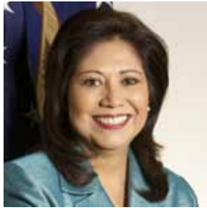
Hilda L. Solis Secretary of Labor